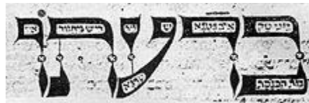
The oldest surviving literary document in Yiddish is a blessing in the 1272 Worms

Apart from the obvious use of Hebrew words for specifically Jewish artifacts, it is very difficult to determine the extent to which the Yiddish spoken in any earlier period differed from the contemporary German. There is a rough consensus that by the 15th century Yiddish would have sounded distinctive to the average German ear, even when restricted to the Germanic component of its vocabulary.