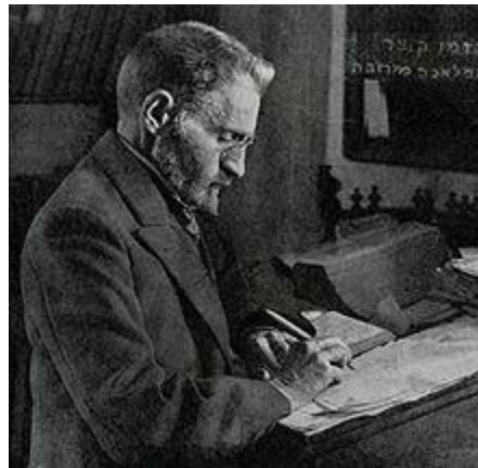
Eliezer Ben Yehuda

In the late 19th century, Jews slowly recognized they needed to have their own land again. To have their own land, they needed to reestablish a universal, unifying, Jewish language. Eliezer Ben Yehuda 3 was the very man for the job. He moved to Palestine and devoted his life to give new life to an old language - the birth of Modern Hebrew. Ben Yehuda's vision and the re-establishment of the Jewish state in their own ancient lands, Askenazim and Sepharadim, all Jews everywhere, could communicate in a common Yiddish , once again.