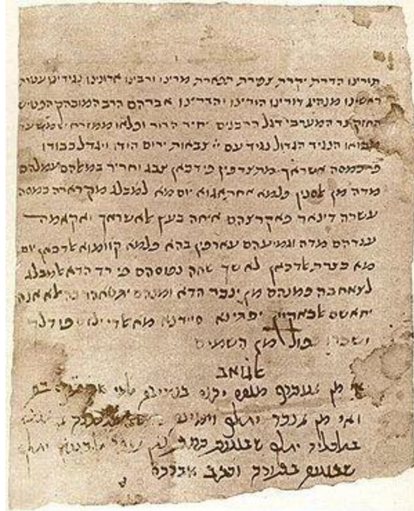
Page from the Cairo Geniza Cairo, part of which is written in the Judeo-Arabic language

"Judeo-Arabic languages are a collection of Arabic language dialects spoken by Jews living or formerly living in Arabic-speaking countries. Just as with the rest of the Arab world, Arabic-speaking Jews had different dialects representative of the different regions in which they lived. Most Judaeo-Arabic dialects were written in modified forms of the Hebrew alphabet, often including consonant dots from the Arabic alphabet to accommodate phonemes that did not exist in the Hebrew alphabet.