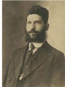
Rabbi Eliezer Silver

The issue of saving Jewish lives was so important, just two days before Yom Kippur, October, 1943, 400 Rabbis gathered for a major march on Washington 28 . The protest and petition march was organized in coordination with the Committee and Rabbi Eliezer Silver 29 of the Union of Orthodox Rabbis of the U.S. and Canada.