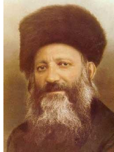
Rabbi Abraham Kook

His Uncle was Abraham Isaac Kook (1865-1935), the first Ashkenazi chief rabbi of British Mandatory Palestine. 15