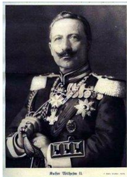
Kaiser Wilhelm II