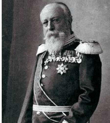
Grand Duke Frederick I of Baden, Uncle to Kaiser Wilhelm II