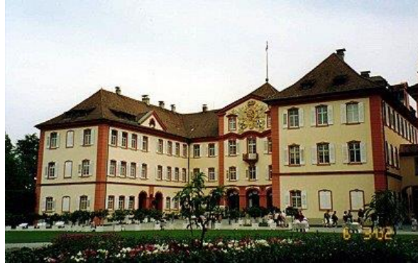
Grand Duke Frederick I summer home - Mainau

The second Zionist Congress convened in Basel August 28-31.