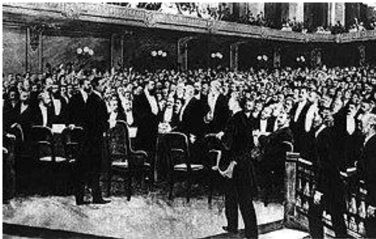
First Zionist Congress – Basel, August, 1897

Herzl's and the Zionist movement's dramatic Congress took place in Basel. To emphasize the theatrical, all attendees were required to be attired in formal wear with top hats. The Congress took on an air of international statesmanship. It was all still an illusion without international legitimization. They needed to be recognized by a great power of Europe otherwise their efforts were resolutions of empty paper. They had no ability to compel or implement anything amongst