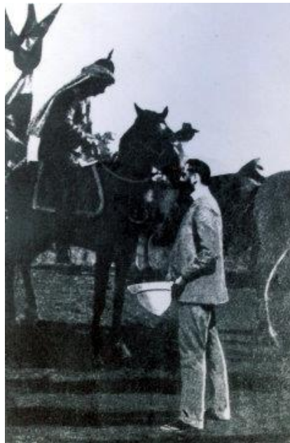
Herzl and Kaiser Wilhelm, at Mikveh Israel

“We approached the land of our fathers with mingled feelings. It is strange what emotions this desolate country evokes in most people: in the old German pastor from South Africa, in the Russian moujik in the vile-smelling steerage, in the Arabs who have been traveling with us from Constantinople, in Zionists like ourselves, in the poor Rumanian Jewess who is going to visiting her sick daughter in ‘Yerushalayim,’ and who has reason to fear she will be turned back on account of her Rumanian passport..... Here we were in Jaffa: again poverty and misery and heat in gay colors.....My good Hechler had arrived. I related what had happened since we last met, and asked him to tell Count Eulenburg that I would await the Kaiser next morning on the highway outside Mikveh Israel.”