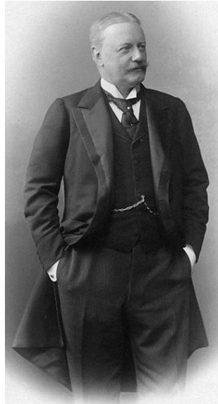
German Foreign Minister von Bulow

Herzl acknowledged the breakthrough came through because of Hechler.