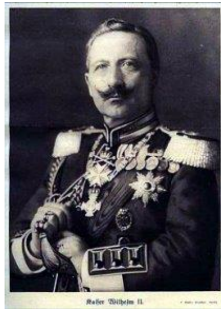
Kaiser Wilhelm II