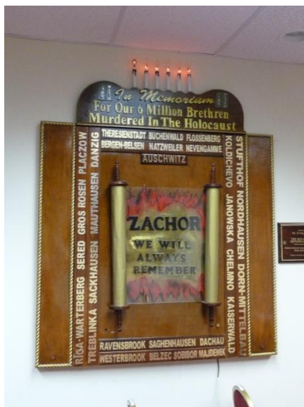
“Murdered in the Holocaust”

American Memorializations of the Holocaust were first begun by the Shoah refugees. Most were erected by Survivor Associations and Survivor City Mutual Aid Societies. They erected simple, carved Memorial stones and placed them in Jewish cemeteries. They wanted to create Memorials for those of their families and communities without a piece of soil to say they ever existed. The refugees were not concerned with forgiveness or any larger, deeper existential meaning to the Shoah that later American and culturally homogenized Jews would seek to interpret. Some of the Survivor Community Memorials wanted God to take revenge, to seek justice. All wanted memory and peace for the souls of the victims.