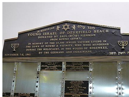
"In memory of the 23,500 Jewish victims living in the town of Rowno and vicinity, who were murdered during the Holocaust in the woods of Sosenkes, by the Germans and Ukrainians, Nov. 7-8, 1941,"

There are an unknown number of Holocaust Memorials in the United States today – no one knows where they are. They have never been catalogued and photographically archived. Some memorials are cemetery memorials, some are rescued Holocaust Torahs, synagogue plaques, memorial boards, free standing Memorials indoors and outdoors, stained glass windows, gardens, interpretive art works, research centers, libraries, web sites, self published biographies, University Holocaust Studies chairs, major city or state sponsored Holocaust Memorials, Museums etc.