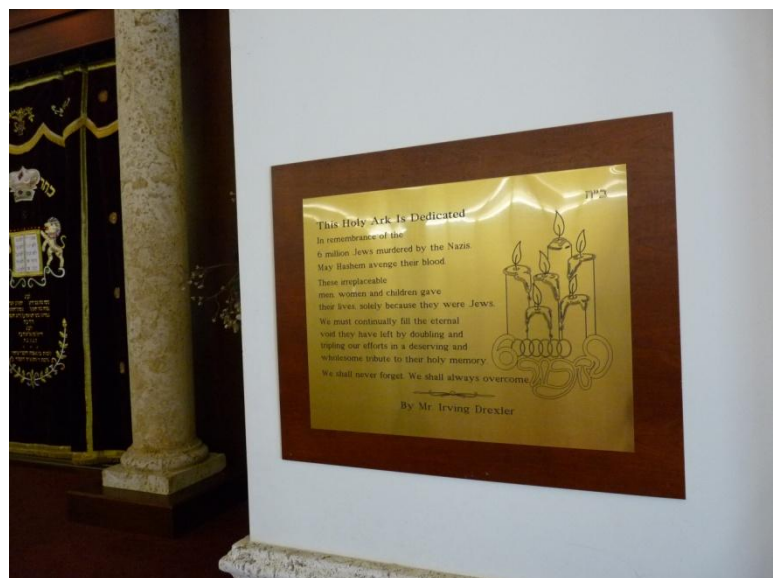
“May God Avenge their Blood”

There were no niceties in the early Holocaust Cemetery Memorials. They were blunt and horrifically graphic in few words they had carved in their stones.