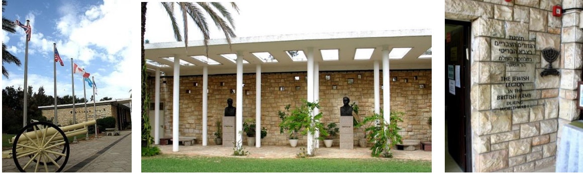
Jewish Legion Museum – Beit HaGedudim