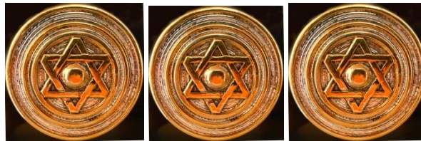
Medallion of the Zion Mule Corp

“There is no exaggeration; Patterson was the commander of the first Jewish fighting force in nearly two millennia. And as such, he can be called the godfather of the Israeli army.”