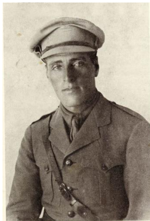
Capt. Joseph Trumpeldor

A confluence of events was occurring in Alexandria, Egypt. The Turks were in control of Palestine. They had a deep disdain for the Arab peasants of Palestine. They had a deeper distrust even hatred for the Jews who had settled in Palestine, the Zionists . The Turks feared that the Jews would side with the British in the war. With a cold hearted decision, the Turks expelled the Jews of Palestine. Most of the desperate, starving, refugees escaped to Egypt.