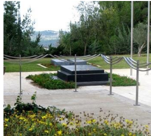
Jabotinsky gravesite, Mt. Herzl

Jabotinsky came to the United States during the summer of 1940. He was reviewing a Betar Youth Camp in upstate New York when he had a massive stroke. He was 59 years old when he died. It was a serious blow to Patterson. He served as one of the pall bearers.