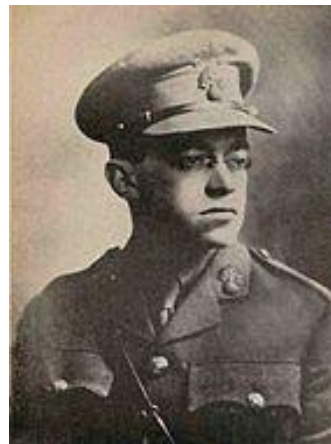
Lt. Vladimir Jabotinsky

As Patterson arrived, a young Russian firebrand, Vladimir Jabotinsky, together with a one armed former Russian Tzarist officer, Joseph Trumpeldor, were organizing the refugees. Both of the men wanted to fight for Palestine, they were Zionists. Palestine was their home and they had been expelled to Egypt. General Maxwell was in desperate need of men. The character of World War I fighting was a virtual butchery shop of men.