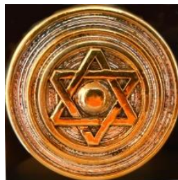
Medallion of the Zion Mule Corp

"History is giving us an opportunity which has not been given to us in almost all the centuries of our exile. We will be the first to fight with our blood for the liberation of our land. We will be followed by thousands of other Jews."