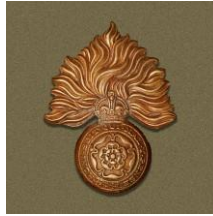
Badge of the Royal Fusiliers

Regiment with the Menorah as their regimental badge. Until that point in time, they would be known as the 38 th Royal Fusiliers.