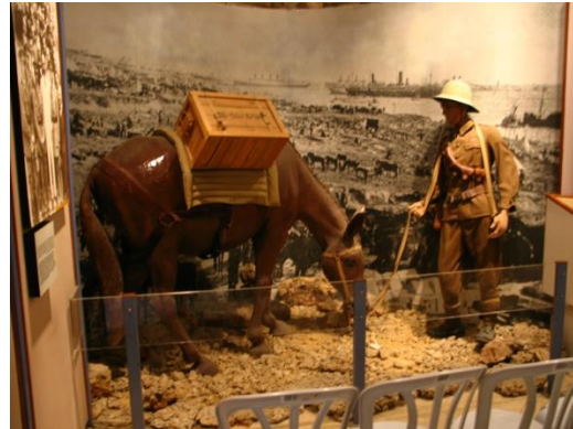
Zion Mule Corps exhibit