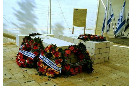
December 4, 2014 – The Reburial