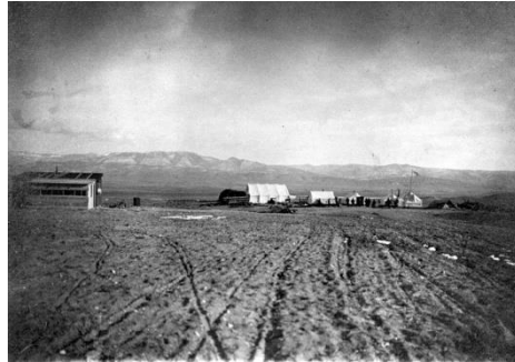
Clarion - 1912