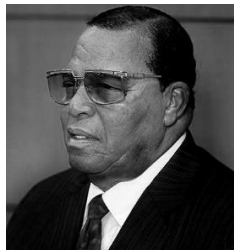
Minister Louis Farrakhan – Nation of Islam

Four times he risked his life specifically to end slavery and free the Black Man.